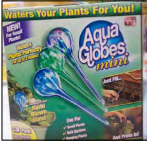
As Seen on TV

The Table Top Showcase portion of the show gave members the chance to look at items from the CDMA Warehouse along with products shipped directly from a variety of CDMA suppliers. As Seen on TV products were extremely popular with big purchases from our members on the show specials offered. CDMA will be merging its Source CDMA everyday items into the Everyday