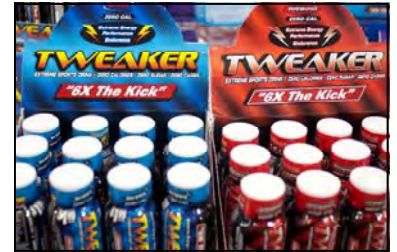
Tweaker Energy Shots

great cost direct and through the CDMA Warehouse. The metal helicopters and AllerMates (kids' bracelets identifying allergies) were both very popular purchases. Fitness Manufacturing Partners is a new supplier to CDMA Members trying to make a splash in the drug channel with fitness and wellness items. Champion Treasures and Sports Tissues with NCAA licensed items were popular suppliers. Returning suppliers Brisco Apparel and Dick Kaufmann offered novelty and basic clothing items that fit the promotional sweet spot for drug stores. Millitti Sales was a popular low-priced impulse supplier along with Atlas Imports and their energy shot called Tweaker (stocked in the CDMA Warehouse!). Many other great suppliers made the trade floor both a good source for front end product but also an enjoyable time as members were all smiles, especially when booth prizes were announced.